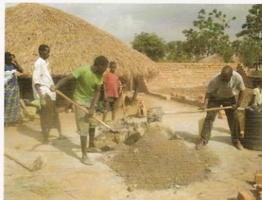
Workers in front of the Aboke Church in Uganda.